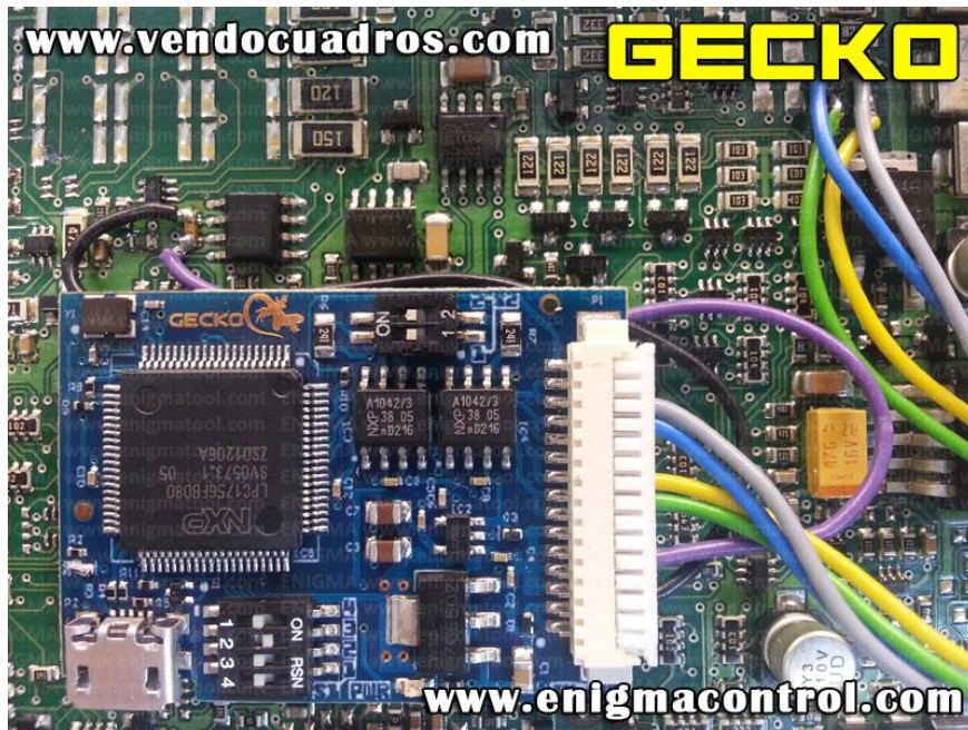
PHOTO4 > MOUNTING EXAMPLE:

GENERAL INFORMATION AND TECHNICAL SUPPORT ON: