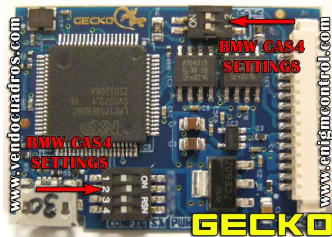
PHOTO1 > BUTTON SETTINGS: