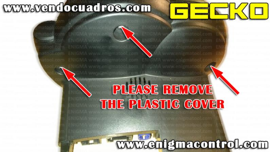
PHOTO3 > REMOVE SCREWS: