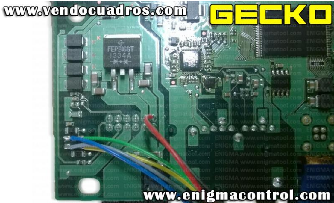
PHOTO7 > MOUNTING EXAMPLE: