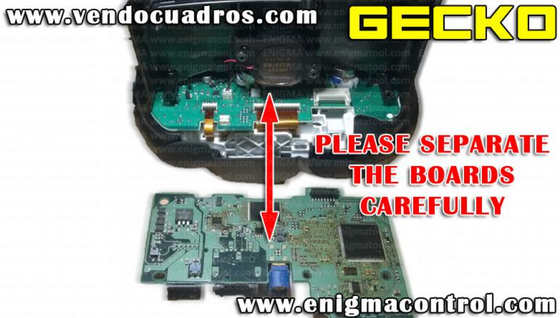
PHOTO5 > GECKO CONNECTION: